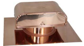
NON-DAMPERED ROOF VENT