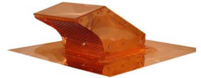
COPPER DAMPERED ROOF VENT