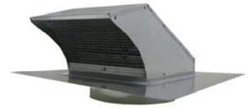
GALVANIZED DAMPERED ROOF VENT