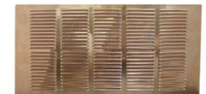
RECTANGULAR EAVE VENT