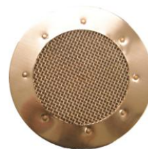
FLAT EAVE VENT