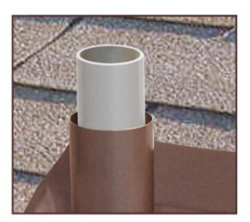
Vent pipe must extend 2" to 5" above base sleeve to allow for roof expansion and contraction. Cut off excess pipe above 5".