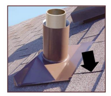
Upper flat section of flange must be completely covered. If necessary, rotate under two rows of shingles and trim shingles to fit.