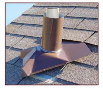
Place the vent flange over the vent pipe and rotate into position under one or more rows of shingles.