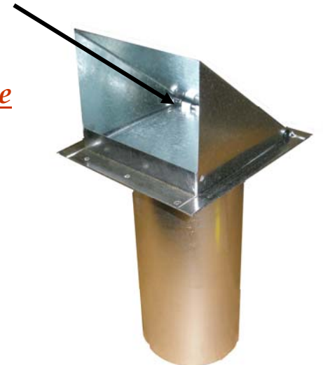
GALVANIZED WALL VENT