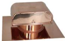
COPPER ROOF CAP