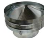
GALVANIZED GLOBE VENT