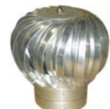
GALVANIZED TURBINE VENT

To Browse Our Products Visit: www.luxurymetals.com