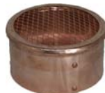
COPPER EAVE VENT