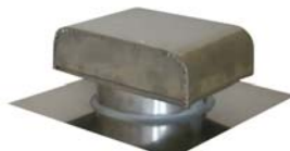
STAINLESS ROOF CAP